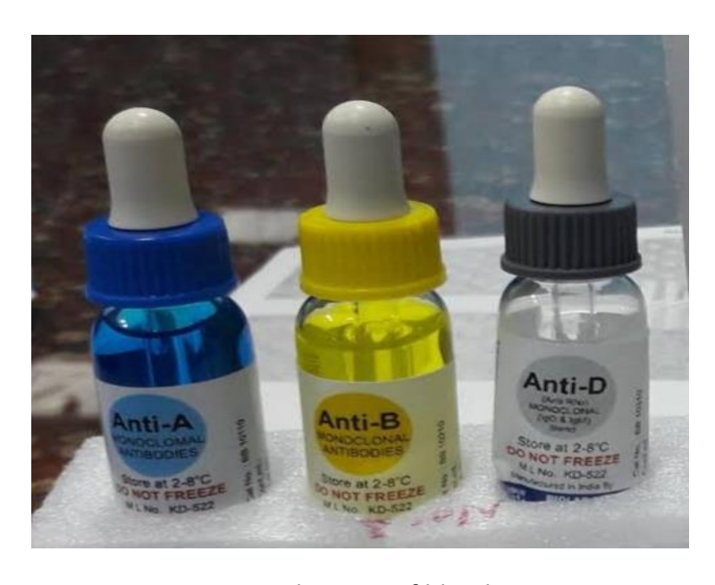
Fig- serum used in case of blood grouping

The blood will agglutinate if the antigens in the patient's blood match the antibodies in the slide. A antibodies attach to A antigens - they match like a lock and key - and thus form a clump of red blood cells. These are also commonly referred to as anti A antibodies, anti B antibodies, and anti Rh antibodies.